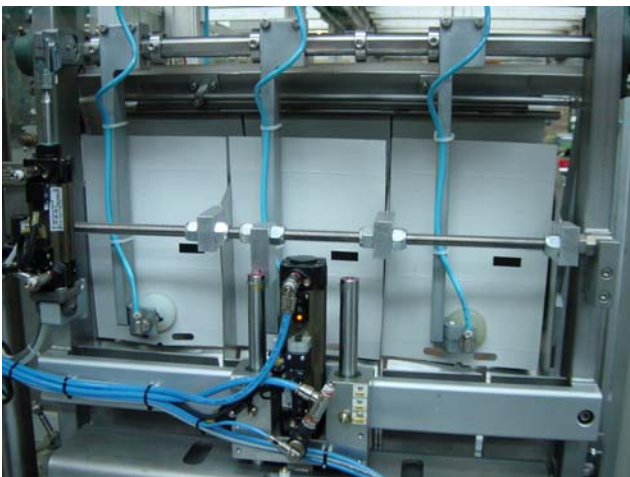
Carton blank magazine with high capacity

Customised options can be designed on request.