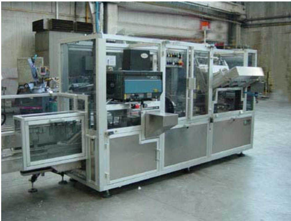
Machine layout .